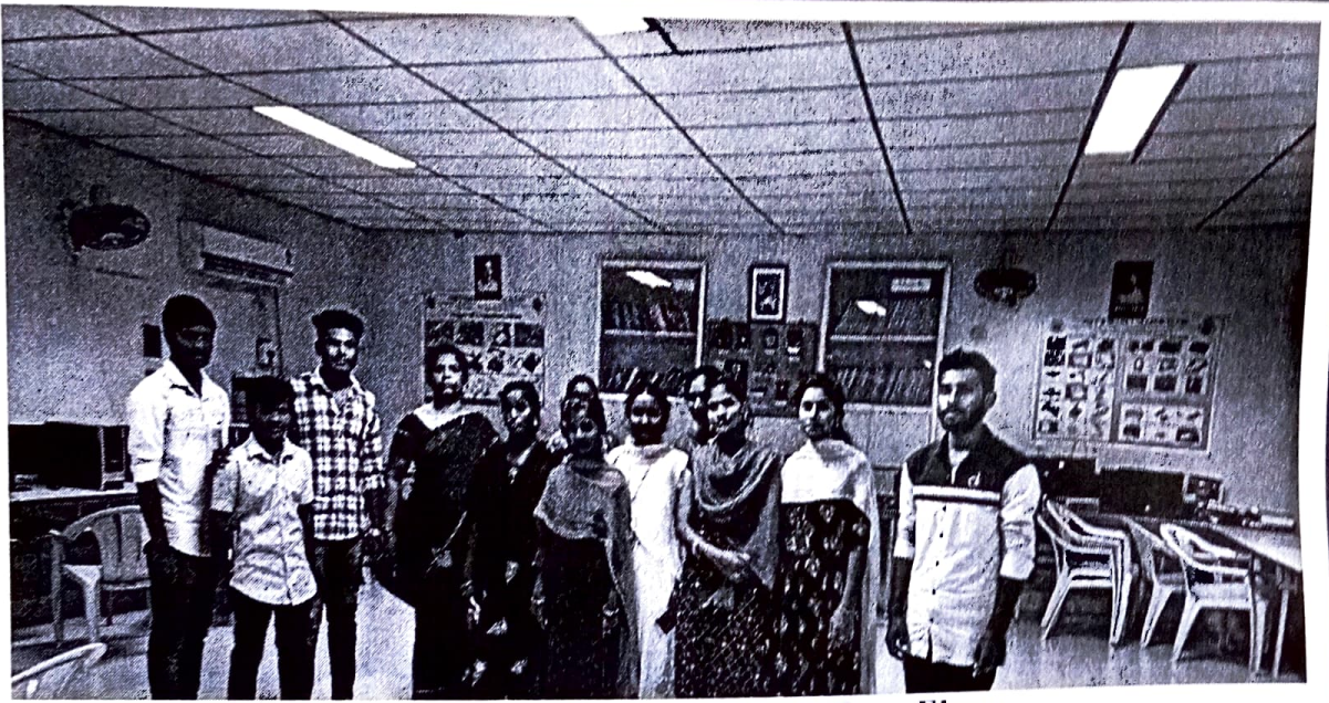
Computer Lab, Sir C.R.Reddy College, Eluru