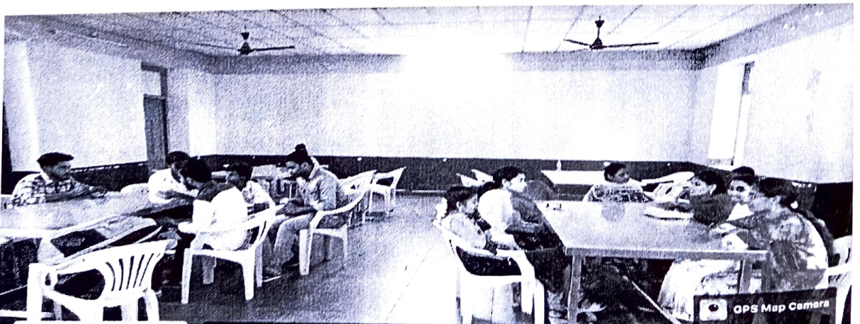
Auditorium, Sir C.R.Reddy College, Eluru

Eluru, Andhra Pradesh, India MDR6, Santhi Nagar, Eluru, Andhra Pradesh 534006, India Lat 16.706534° Long 81.086497° 03/01/22 11:46 AM